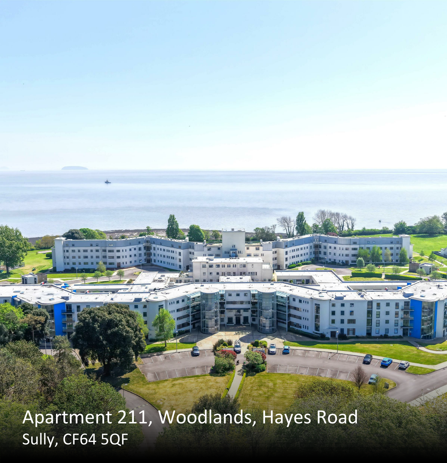
Apartment 211, Woodlands, Hayes Road Sully, CF64 5QF